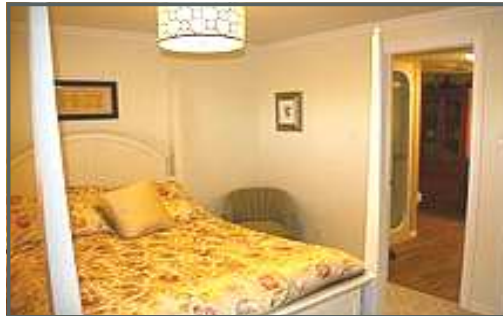
Country Manor Room