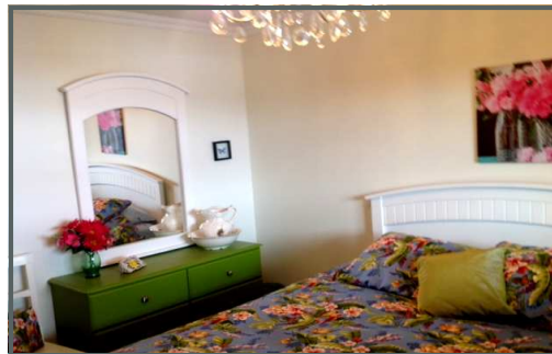
Island Oasis Room

The B&B area is a private 1700 ft 2 space with a gorgeous waterside view and all the comforts of home