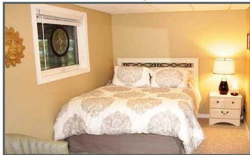
Cozy Corner Room