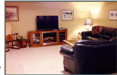
Guest Great Room